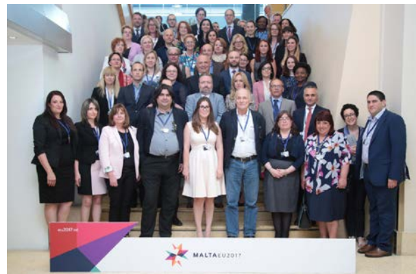
Delegates at the EMN Conference 2017 in Malta

The organisers brought together more than 250 experts from different fields (e.g. engaged in law enforcement and/or migration) from all EU Member States. In several panel discussions, speakers from the European Commission, EU agencies, inter-governmental and non-governmental organisations, academia and selected EU and non-EU countries presented their views on the implementation of the Common European Asylum System, including the current situation of asylum flows and possible future trends, the asylum procedures and reception conditions in the EU, existing legal pathways and resettlement programmes. Participants also discussed intra-EU solidarity and cooperation with third countries. The conference brought to the fore different asylum practices and lessons learned from various Member States.